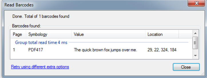
Figure 1: A badly damaged PDF417 barcode that is still successfully read by LEADTOOLS

This is where LEADTOOLS excels! With over two decades of experience in creating digital imaging software development toolkits, we have seen it all. One of the biggest deciding factors for developers shopping for and testing different barcode toolkits is how well it works on their images. This can actually present a catch-22 because they are developing an application which has yet to be deployed into production and they don't have a large enough sample of images and situations.