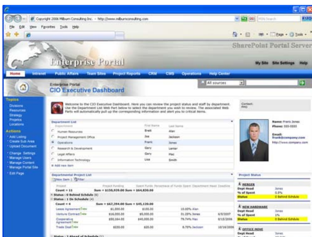
Project Review Dashboard

Executive Dashboards often function like the eyes and ears of an enterprise. They serve as a secure website of websites that is the single gateway which unifies access to all enterprise information and applications for that individual. It distills the complexity and variety of information and services available to a user into a single interface targeted to that user's needs and access rights. Focused on delivering timely and relevant information based on business rules, Executive Dashboards are custom manifestation of an enterprise portal that has the ability to aggregate real-time data from both internal and external sources.